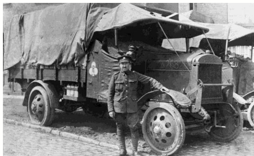
A soldier and vehicles of the 960 Motor Transport Company, ASC. © IWM image Q71933.

Each Division of the army had a certain amount of motorised transport allocated to it, although not directly under its own command. The Divisional Supply Column Companies were responsible for the supply of goods, equipment and ammunition from the Divisional railhead to refilling points and, if conditions allowed, to the dumps and stores of the forward units.