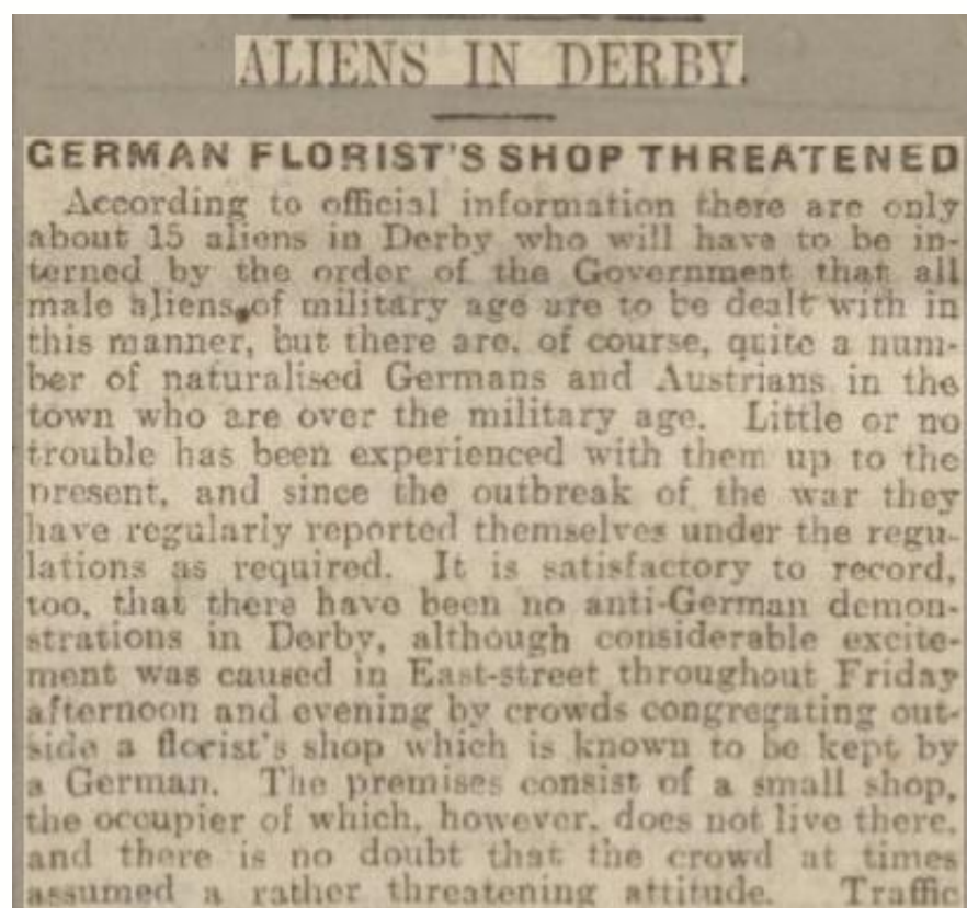
The Derby Daily Telegraph for 15 May 1915 reported that the police kept watch on the unruly crowd and no damage was done.